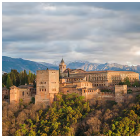
ALHAMBRA PALACE, GRANADA