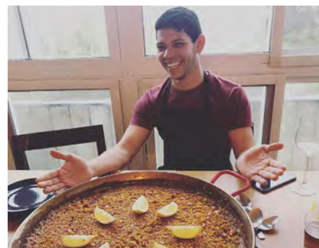
AUTHENTIC DINING Learn the traditional recipe of paella. (Photo by @Simoninsighttd, Day 3, Valencia)

After breakfast, transfers arrive at Madrid airport at 07:00, 09:00 and 11:00. (B)