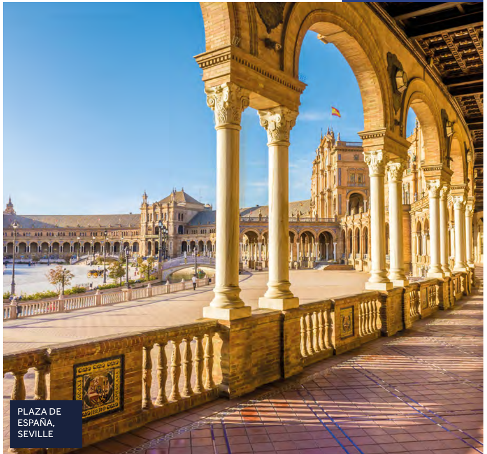
PLAZA DE ESPAÑA, SEVILLE