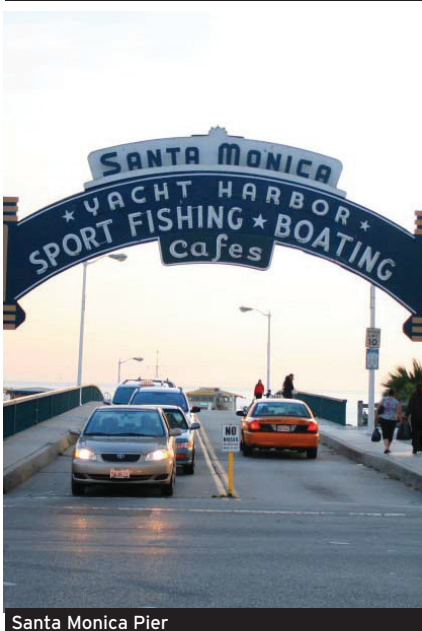
Santa Monica Pier