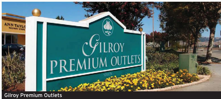
Gilroy Premium Outlets