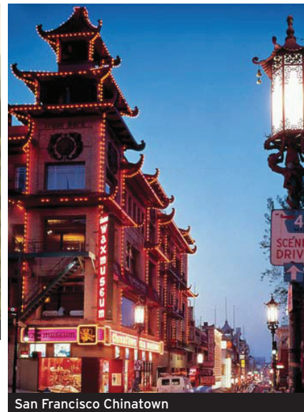
San Francisco Chinatown